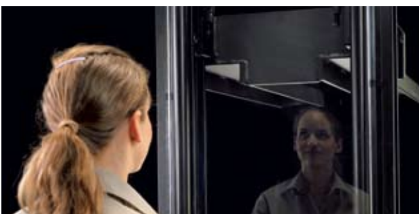
The BT Totalview design concept ensures the fork tips are visible from the operating position

All BT Staxio models come with useful storage compartments on top of the truck body. An optional 'E-bar' allows mounting of a writing table and shrinkwrap holder, as well as powered ancillary equipment such as PCs, radio-data terminals and barcode scanners.