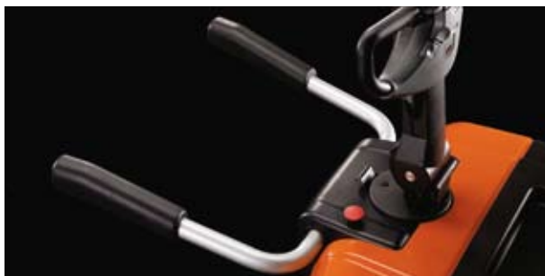
Folding sideguards offer protection to the operator without compromising the manoeuvrability advantages of the flip-down platform

A large emergency button is located at the tip of the handle. This ensures that the truck's direction will be reversed immediately if the handle encounters an obstacle, preventing the truck from crushing the operator. To further ensure operator safety, all models feature skirting that offers full protection to the feet.