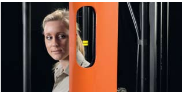
The visibility window adds to the S-series’ high safety standards

With the forks lowered the support arm lift has a maximum capacity of 1600 kg for horizontal travel and 1200 kg for stacking.