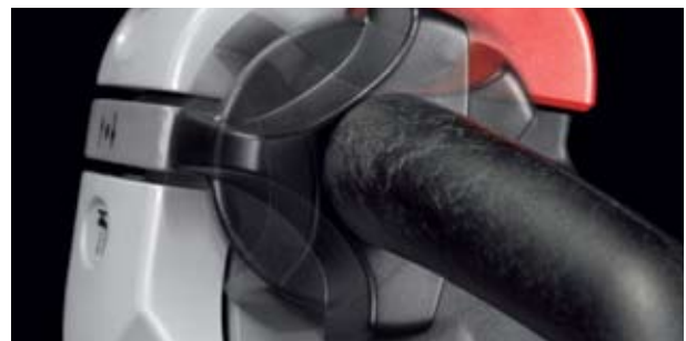
The Click-2-Creep function allows the truck to be manoeuvred with the handle upright