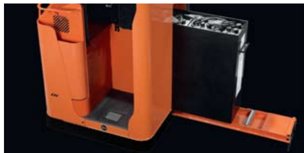
The battery on S-series models is seated on rollers with a built in battery table, allowing easy sideways battery exchange