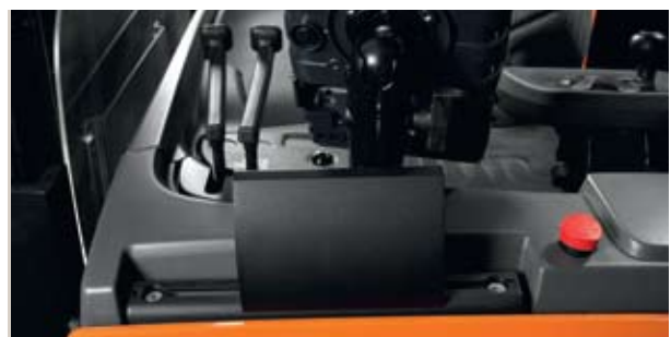
The E-bar universal mount for warehouse management devices such as PCs, terminals, bar code readers