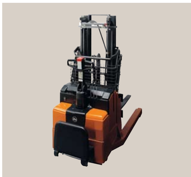
The RWE120 is a pedestrian-operated reach truck with a lift height of 4.8 m