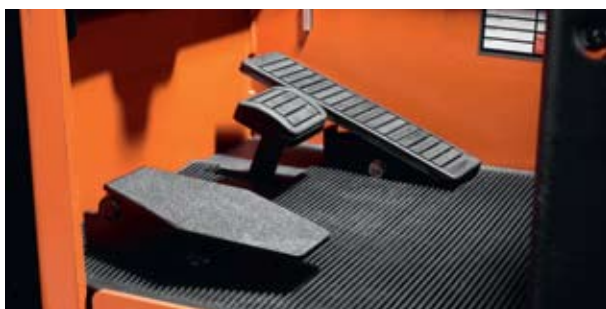
Pedal layout is as in a car, optimising safety and productivity

The SRE135L and SRE160L models feature elevating support arms that allow effective operation on ramps or over uneven surfaces. These also allows double pallet handling, with 675 kg + 675 kg (SRE135L) and 800 kg + 800 kg (SRE160L).