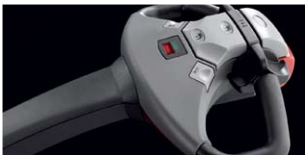
The tiller arm's control handle incorporates BT Powerdrive technology, for easy, intuitive control

All models are available with the E-bar mounting rail for ancillary equipment such as writing tables and shrinkwrap holders. It can also incorporate a power supply for items such as PCs, radio-data terminals and barcode scanners.