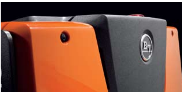
The hood is secured by two bolts for fast access

connectors and CAN-Bus wiring all add up to maximum reliability. W-series models are designed to be serviced only once a year in typical single-shift operations.