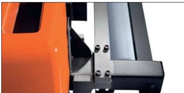
The HWE100S offers the same features as the HWE100 but also has straddle arms for handling different pallet sizes. Both models have a maximum lift height of two metres

The HWE100 features the unique BT Castorlink system with castor wheels that rotate within the truck's body profile. This provides smooth and easy operation on ramps and reduces the risk of wheel damage.