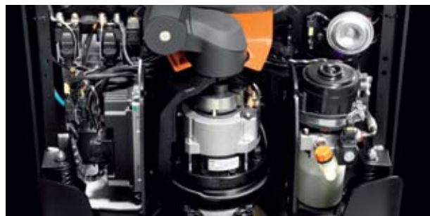
The fixed motor has no moving cables