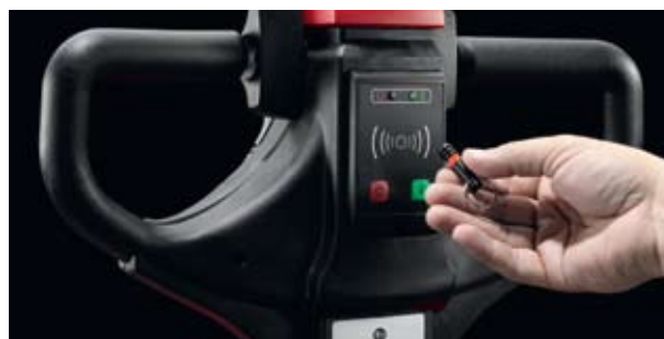
'Smart access' with a remote key or card ensures the truck starts-up with the appropriate performance settings for each operator