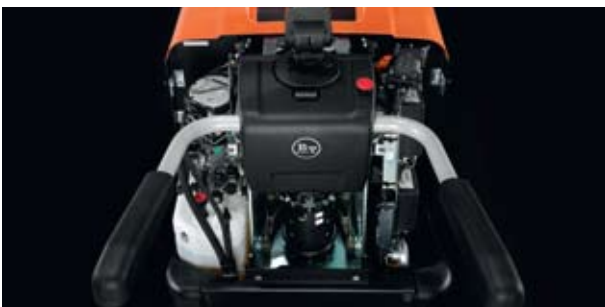
BT Powerdrive reduces components to a minimum

Part of the BT Staxio P-series range, the RWE120 is a pedestrian reach truck with moving mast. It also has adjustable width forks, for mixed or bottom-boarded pallet handling. Its maximum lift height is 4.8 m and load capacity 1200 kg.