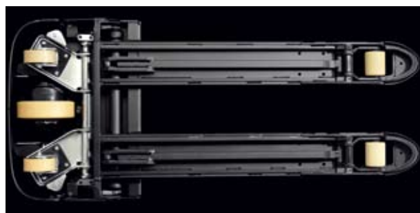
BT's unique 5-wheel chassis improves stability on ramps