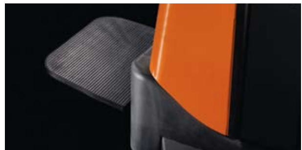
BT Staxio P-series models can be specified with or without rider platforms