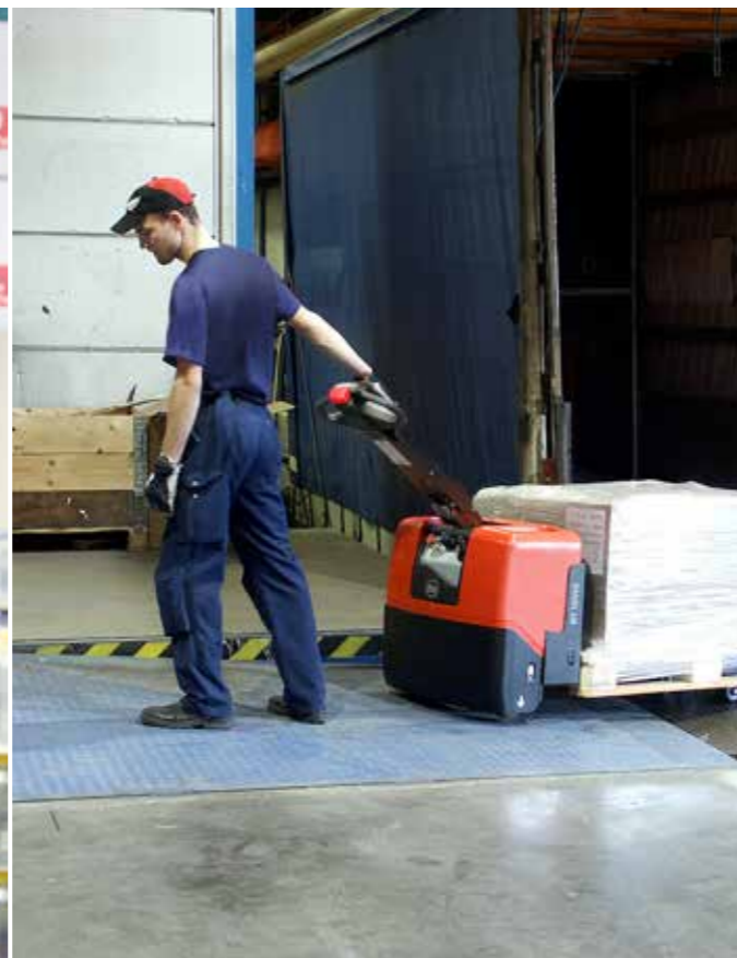
The BT Levio LWE130 moves heavy loads with ease.