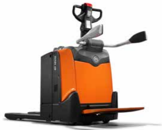
Standardausführung: nach oben klappende Plattform und leicht zu justierende Seitenschutzbügel